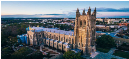
Aerial view of the Duke University Chapel in the center of the Duke campus in Durham, N.C. Completed in 1932, this gothic-style chapel seats over 1,800 people and stands 210 feet, making it one of the tallest buildings in Durham County. Haiss is a graduate of Duke University.

The term narthex, Greek for “scourge,” refers to a porch or gathering space outside the main worship space (or nave). Early Christians used this term to refer to the outer portico where penitents (those who had committed serious sins) and catechumens (converts preparing for baptism) gathered for worship. Penitents and catechumens were not permitted to worship with other Christians in the main worship space until they had completed their orientation or reorientation to Christian life. Today, this gathering place functions as an interface between the church and the world, a space for welcoming.