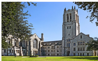
The Neo-Gothic styling of St. Paul's United Methodist Church in Houston, Texas, built in the late 1920s, features a cruciform plan on a steel-frame structure with limestone cladding. Stained glass windows are from the original structure, and the tower's bells were brought from the church's original sanctuary.

Many church architecture terms come from Latin and Greek origins.