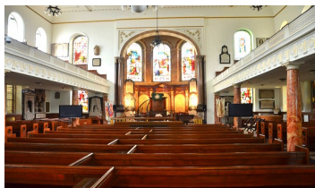
A view down the nave or principal longitudinal area of a church in Wesley's Chapel in the London Borough of Islington. Originally City Road Chapel, the Methodist church was built in 1778 under the direction of John Wesley.

The term narthex, Greek for “scourge,” refers to a porch or gathering space outside the main worship space (or nave). Early Christians used this term to refer to the outer portico where penitents (those who had committed serious sins) and catechumens (converts preparing for baptism) gathered for worship. Penitents and catechumens were not permitted to worship with other Christians in the main worship space until they had completed their orientation or reorientation to Christian life. Today, this gathering place functions as an interface between the church and the world, a space for welcoming.